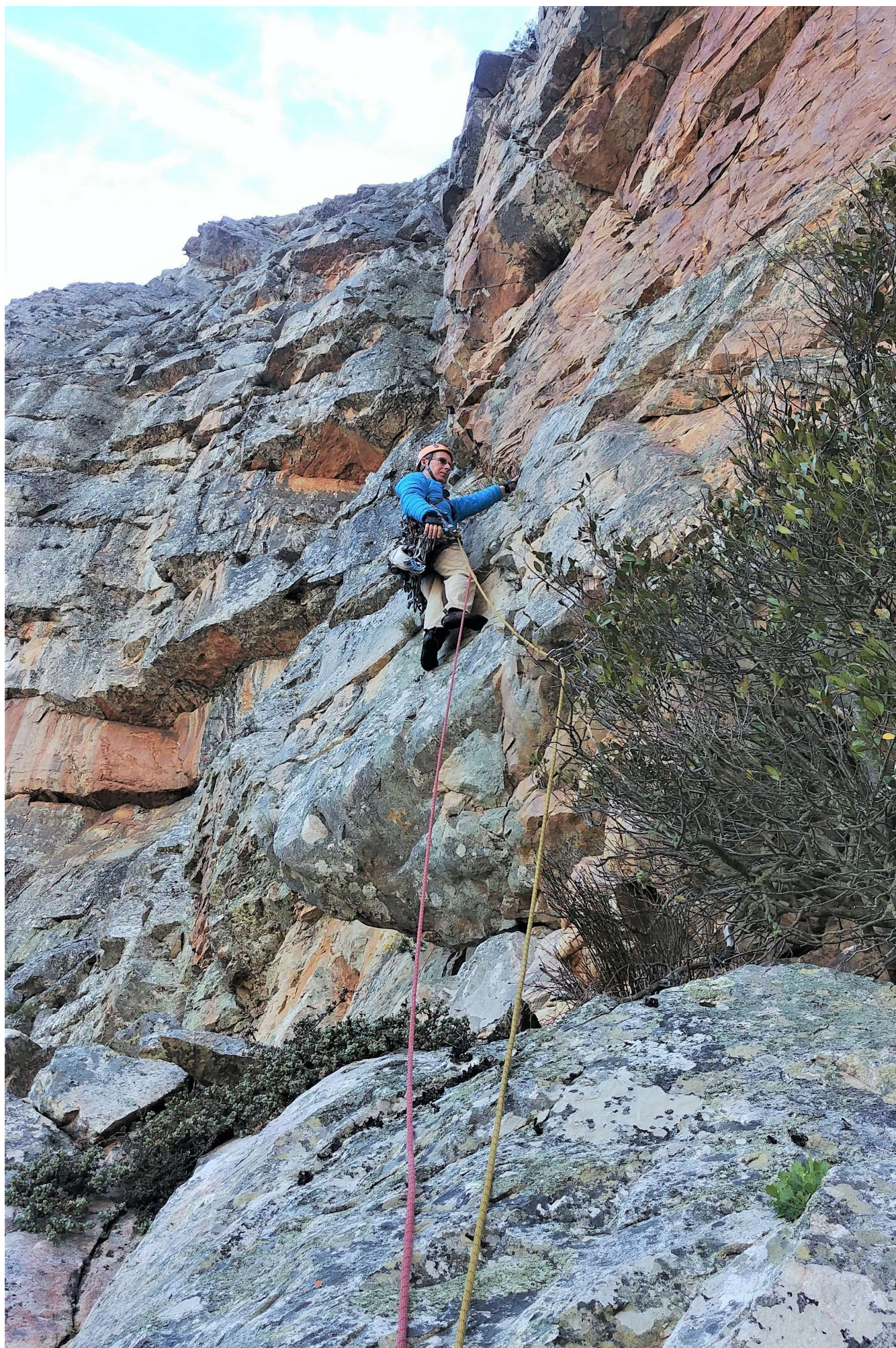
Snort starting off on the first pitch of Terrific Time.